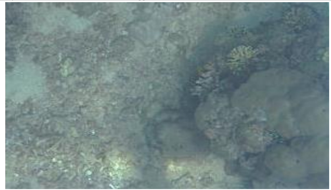
Fig. 2: Photo from rubble (dead coral) at the study area